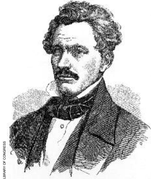
Self-taught sculptor Clark Mills was commissioned by the Jackson Monument Committee to create the Jackson equestrian statue in 1848. He made his casting in a temporary foundry on the Ellipse. He also cast here an equestrian statue of George Washington that stands at Washington Circle on Pennsylvania Avenue. At a later octagon-shaped foundry he built on Bladensburg Road (above) he cast Thomas Crawford's Freedom , which was placed atop the dome of the Capitol in 1863.