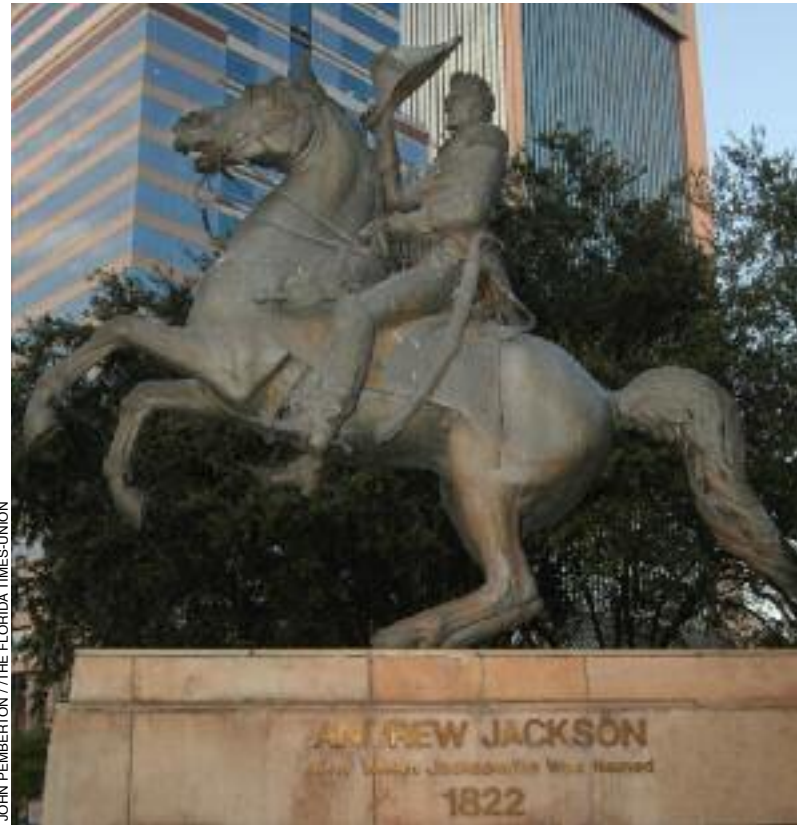
Jacksonville's dramatic modern skyline looms over the 1987 casting of Mills's equestrian Jackson, for whom the north Florida city is named.