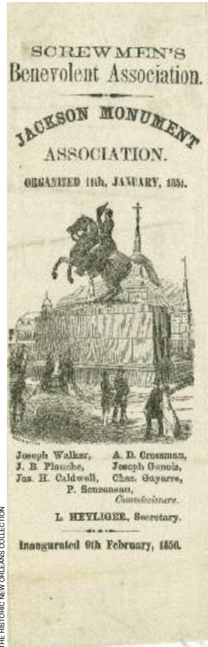
THE HISTORIC NEW ORLEANS COLLECTION