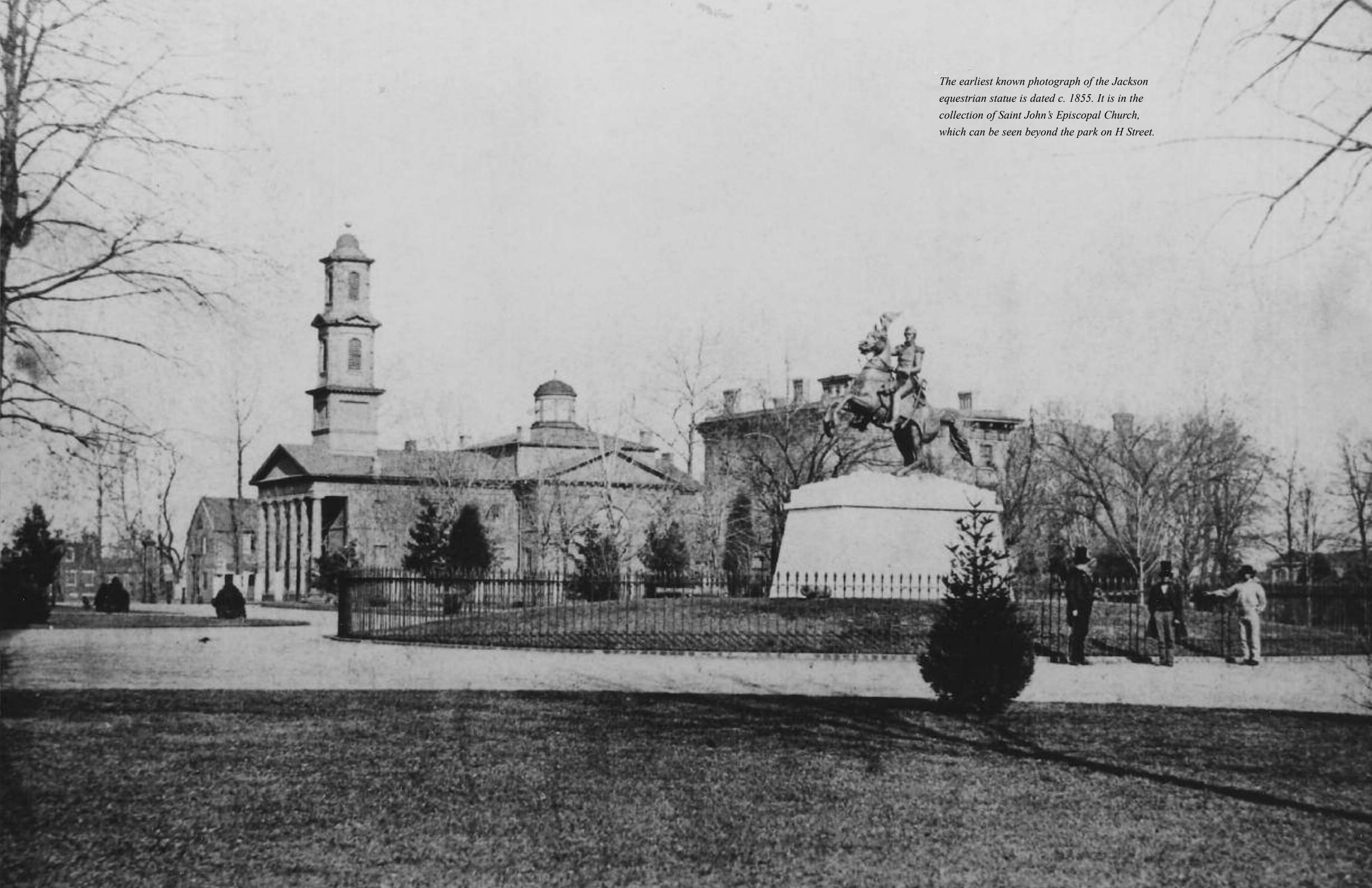
The earliest known photograph of the Jackson equestrian statue is dated c. 1855. It is in the collection of Saint John's Episcopal Church, which can be seen beyond the park on H Street.