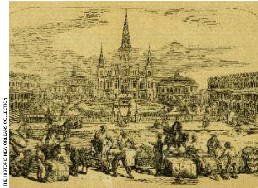
THE HISTORIC NEW ORLEANS COLLECTION