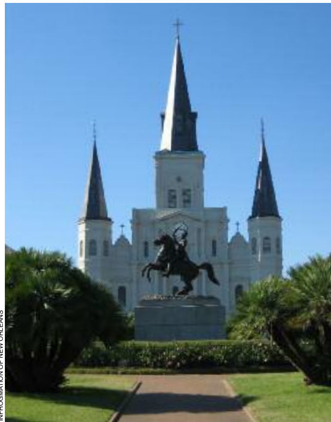
INFOGRAMATION OF NEW ORLEANS